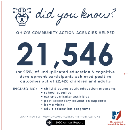
Slide 3 - Stats, Education & Cog Dev