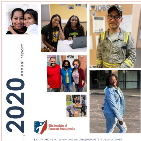
Page 1- AR 2020 Cover

@OACAA's 2020 Annual Report highlights 13 inspiring customer success stories from the Ohio #CommunityAction network and statistics from a year like no other. Read the report: