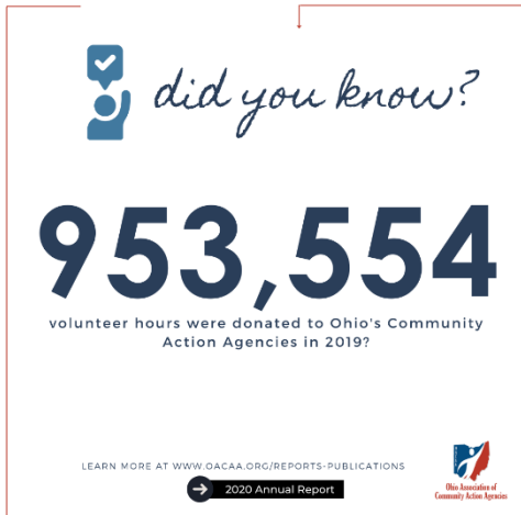
Slide 6 - Stats, Volunteers