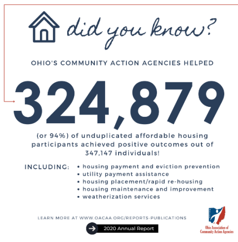
Page 2 - Stats, Affordable Housing