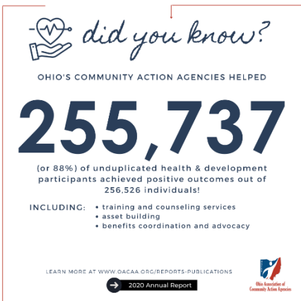
Slide 5 - Stats, Health & Dev

Did you know that 96% of participants in #CommunityAction's outstanding education and cognitive development programs achieved positive outcomes last year? Register for Head Start at [AGENCY] today! [INSERT APPLICATION LINK] #BeCommunityAction #CommunityActionResponds