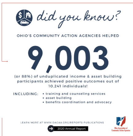
Slide 4 - Stats, Income & Asset Bldg

Over 255,000 participants received health & development services in 2020, 99.7% of which achieved positive outcomes! Many agencies opened pop-up COVID-19 testing sites and implemented no-cost transportation to vaccinations locations. Learn more https://bit.ly/3AQxHJW . #BeCommunityAction #CommunityActionResponds