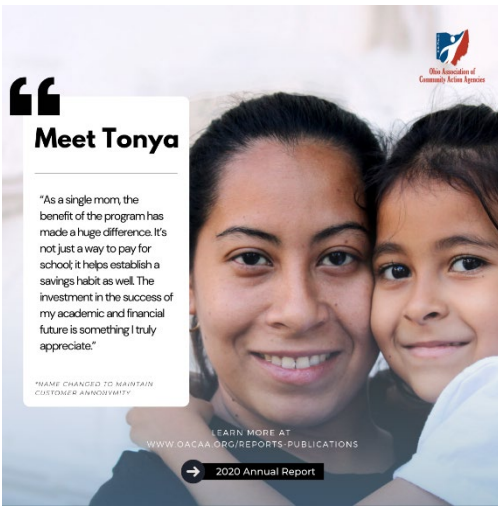
Slide 8 - Story Tonya, Income & Asset Bldg

Thank you to the #CommunityAction volunteers who donated nearly 1,000,000 service hours last year! Volunteers provide valuable support to the network and allow agencies to have a greater impact. Learn more https://bit.ly/3AQxHJW . #BeCommunityAction