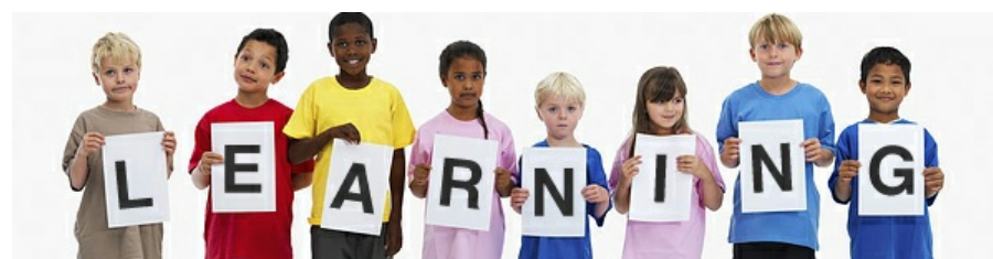
2020 Census in the Classroom

Alabama, Mississippi, Florida and Georgia Associations along with our national partners came together to discuss strategies for the upcoming 2019-2020 HCCT grant. The Associations also discussed organizational standards, T&TA coordination, and capacity building. Regional IVA is currently accepting project submissions for the upcoming 2019-20 HCCT grant. RPIC IVA is also planning a HCCT Symposium for November 12-13, 2019 in Atlanta, Georgia.