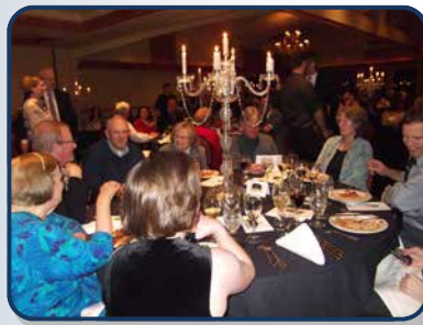
Guests enjoy delicious cuisine and great conversation.