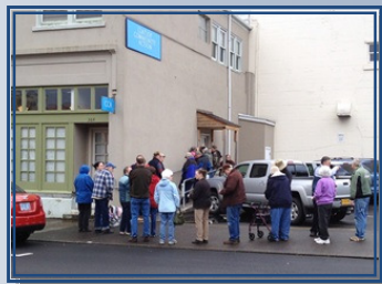
Clatsop Community Action "Woodlot Day"

At CCA Regional Food Bank we take pride in the various community partnerships formed with organizations across the state and county to find additional ways to ease the pain of hunger insecurity for people in our communities. Once again, we partnered in the production and distribution process of the county-wide Christmas Basket Programs . Approximately 1,434 baskets of food were distributed to families in Astoria, Knappa, Warrenton, Hammond, Jewell, Seaside, and Cannon Beach helping to prepare holiday dinners for 3,461 people. Many of the baskets also included gifts for thousands of children. The pick-up or delivery of these baskets was spread over a four day period of time with a delivery rate to recipients of over 94%. CCA regional Food Bank formed a calling tree up until Christmas Eve in order to ensure deliveries to families. Many private and public organizations joined together to orchestrate the success of this outstanding effort!