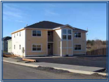
Tilikum Transitional Housing