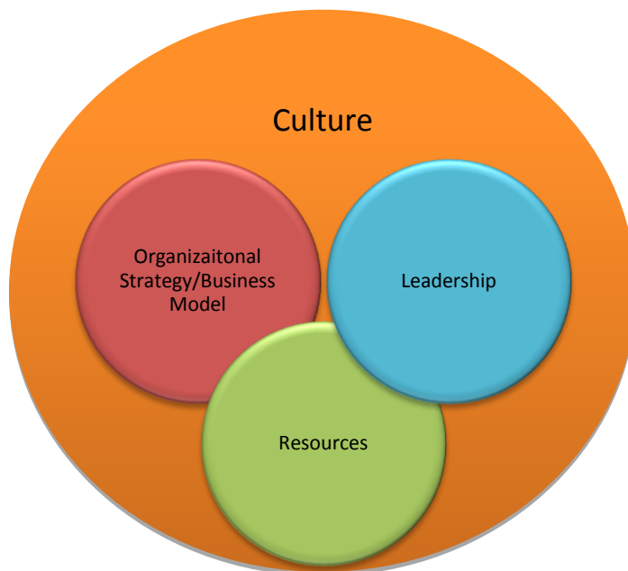
Figure 1: The Four Elements of Organizational Sustainability