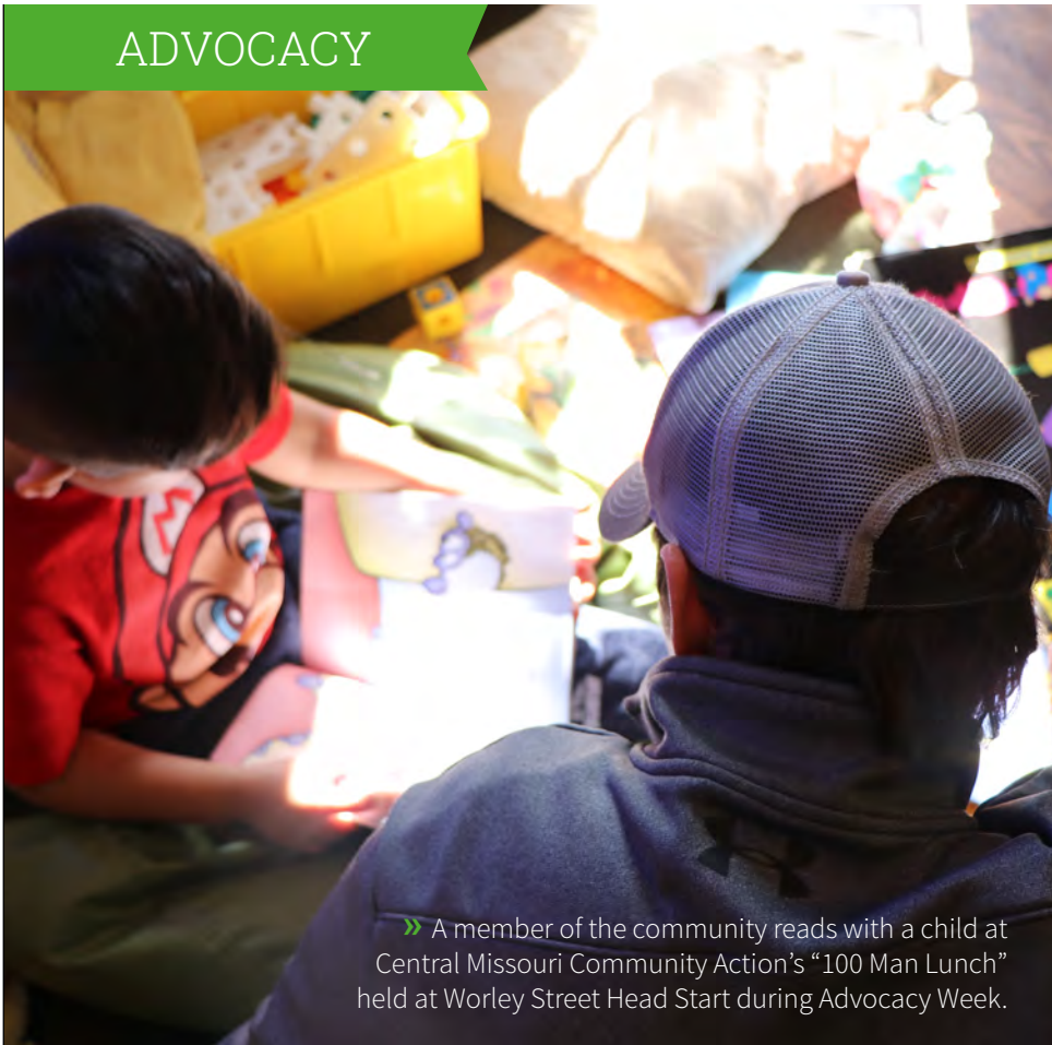
» A member of the community reads with a child at Central Missouri Community Action’s “100 Man Lunch” held at Worley Street Head Start during Advocacy Week.